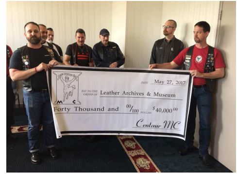
Photo: Centaur Motorcycle Club presents $40,000 check to Leather Archives and Museum at IMBB IML 2017 Chicago, IL.