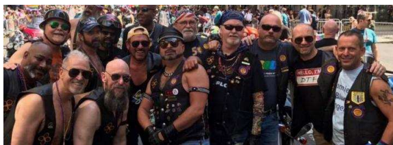
Empire City MC is a proud member of the Atlantic Motorcycle Coordinating Council. We're on facebook! All material copyright ©MMXVII Empire City MC, Inc., All rights reserved