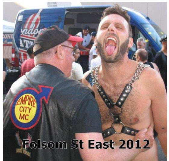
Folsom St East 2012