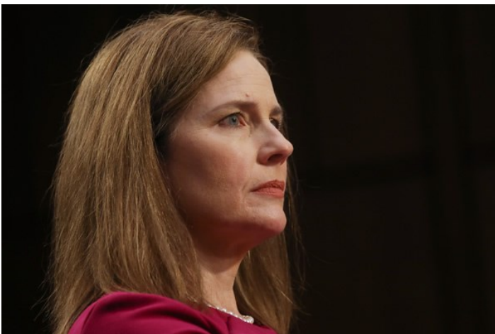
Judge Amy Coney Barrett nominee to the Supreme Court.