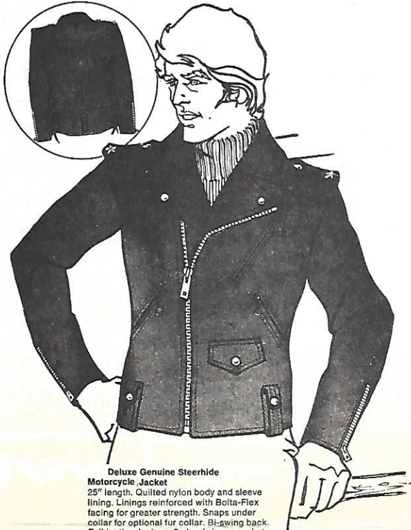
Deluxe Genuine Steerhide Motorcycle Jacket 25" length. Quilted nylon body and sleeve lining. Linings reinforced with Bolta-Flex facing for greater strength. Snaps under collar for optional fur collar. Bl-swing back. Full leather facings. 3 piped zipper pockets and change pocket with flap. Heavy duty front zipper, zippered sleeve bottoms. Stars on shoulder epaulets. Large buckle on belt.