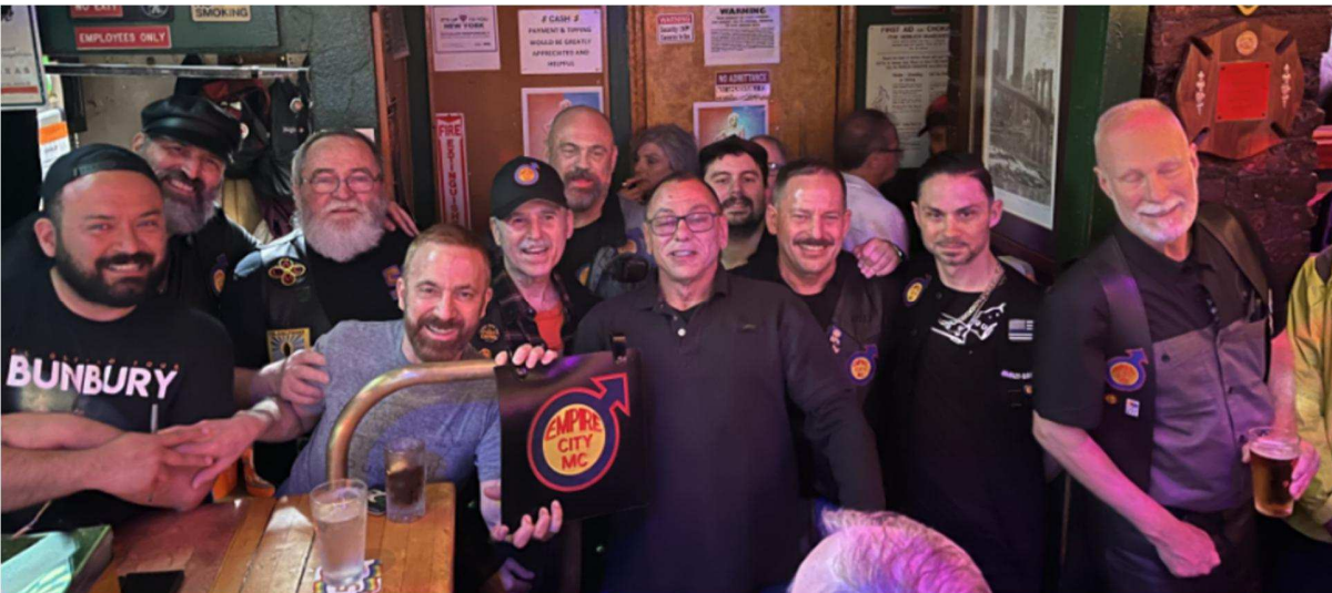
Presentation of Colours at Ty's