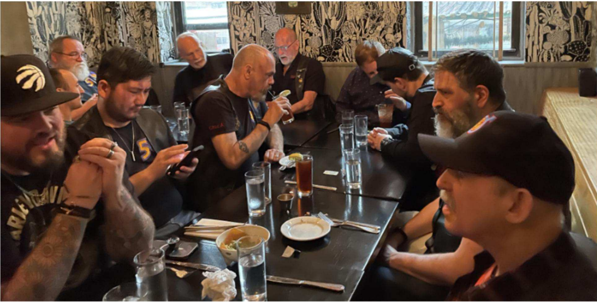
Installation Dinner at La Contenta Oeste