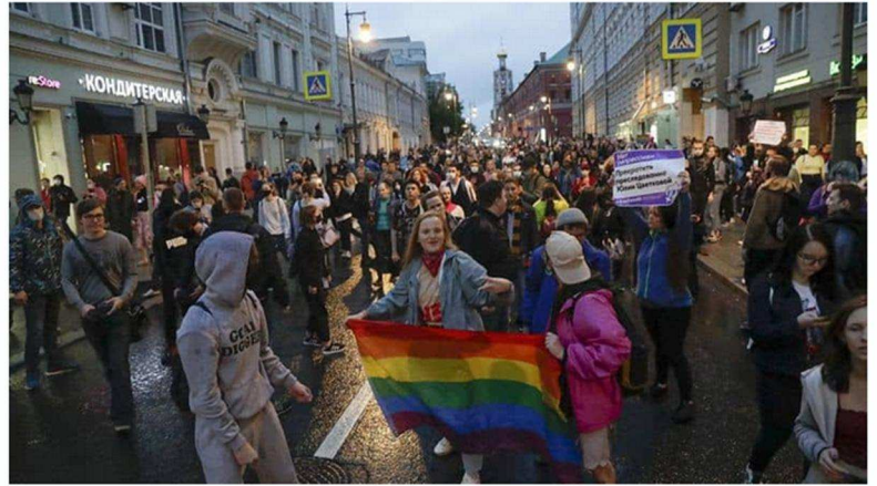
LGBT activists rally to cancel the results of voting on amendments to the constitution in Pushkin Square

Human rights activists in Russia have sounded the alarm over this, and they warn that it could lead to individuals resorting to black market surgeries and a spike in deaths, as well as penalties and imprisonment.