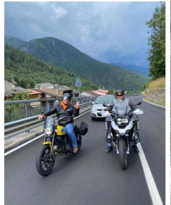
K.K. and me on our rental bikes

It rained on us for about four hours – we remained mostly dry though! By the time we were on the outskirts of the Dolomites, the sun came out, we took off our rain suits and any remaining moisture quickly evaporated away. As we arrived into the foothills of the Dolomites in Canazei (in the Autonomous Province of Trento), we noticed a heavy police presence and helicopters in the air. On the prior day, there was a massive glacier avalanche, accompanied by rock slides in the Italian Dolomite Mountains less than 5km from our hotel, killing at least eight people and injuring dozens of other hikers. You might have seen this on the news recently.