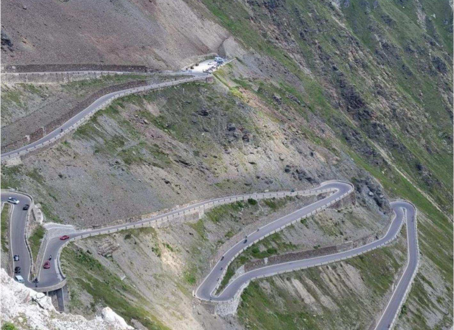
The switch-backs on the back-side of Stelvio Pass

On DAY 6 we left the mountainous region and headed towards Venice (but didn't go quite that far!), staying for two nights in Limone on Lake Garda. They are known for their Lemons and expensive spas. We took DAY 7 off from riding to allow our bodies to recover and do some sight-seeing! On DAY 8, we returned to Milano rode back to Milano to return the rental bikes and attend the closing banquet.