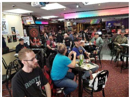
Meet & Greet ◆ Drag Queen Dirty Bingo ◆ All-You-Can-Eat Brunch ◆ Dancing Boys ◆ Formal Dinner ◆ Sauna Fun ◆ Pool Party

As usual, Spearhead had a ton of things for us to do and a lot of new and old friends. The Ottawa Knights were there in spades, as were several other clubs and title-holders. Even though on the eve of the Coronavirus, we got together from high and low to celebrate Spearhead's 50<sup>th</sup> year.